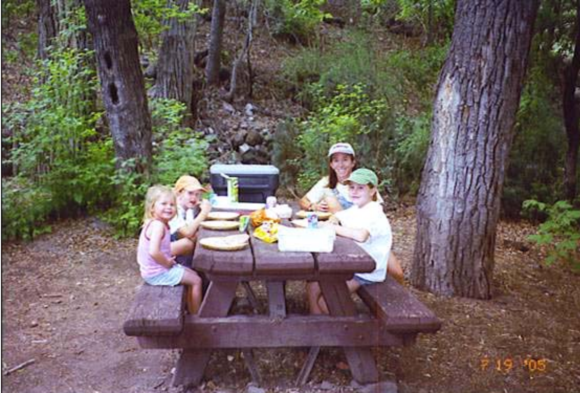
Submitted by Charlie Babcock

The Babcock family spent 7 days near St Johns Arizona. We traveled down many forest roads in and around the White Mountains. Exploring the Salt River at the bottom of the canyon and driving as high as 10,200' to the top of Greenspeak. One our favorite pass times is to take random primitive roads exploring for new and exciting locations. One such area we found in the Blue Range Primitive area south east from Alpine. The Blue River runs through the middle of this area and the wildlife is everywhere. The kids love to walk down the river catching crawdads, frogs and fish. We stopped for lunch near the river at a beautiful campsite. We've been to this area 4 or 5 times and only once saw a single vehicle stopped there. This would be a great light wheeling club run/campout but its 4+ hours from here.