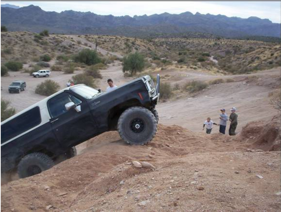
Submitted by Charlie Babcock