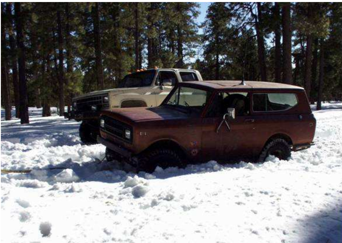
Steve's Scout only needed a tug once or twice, it did great in the mud and snow.