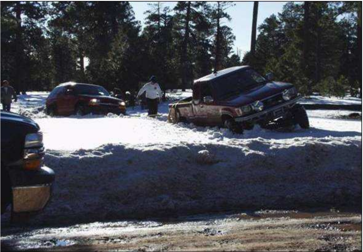
Nick almost made it to the road through some deep snow pulling a load.